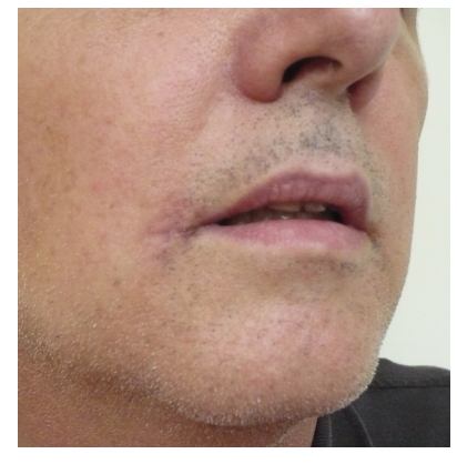
By June 12, 2008, the eschar had completely ejected, the decavitation filled in, and I was into "heal over."

Nine days later (June 21) all that remained was minor hyperpigmentation that was gone in the subsequent weeks.