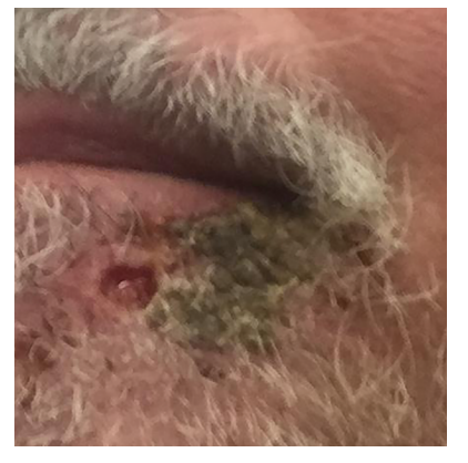
By the next day, detritus from the eschars was already falling off, leaving, in one spot, a very prominent, circular decavitation.