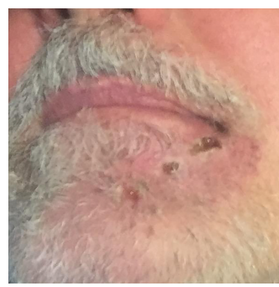
By December 23, very little remained.

Because I still felt a slight itch next to the corner of my