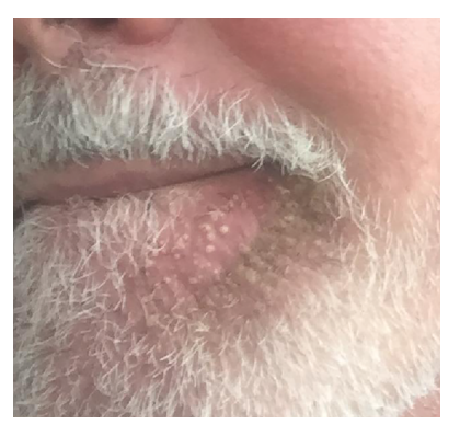
tensively escharized. A number of distinct, unconnected eschars had formed.

Not a lot can be seen in the general area in the next photo, except for a light rash and a few pimples. However, I knew the area was going to be very reactive, and it was. The left photo below was taken on December 4, about six days after yet another Black Salve application. By this time, the area was ex-