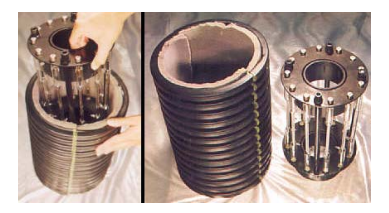
5. Seat the Crown. The crown sits on top of the coil. In the picture below, the right half of the photo shows the bottom of the crown. Note that there are two concentric "lips" into which the top of the coil will snugly fit. Also note that there is a metal copper connector between these concentric rings. This connector MUST make contact with the metal connector at the top of the coil (see the left side of the photo below) in order for your Tesla Photon Machine to work.