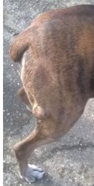
AFTER PHOTOS BY 1/9/2020 (6.5 weeks)